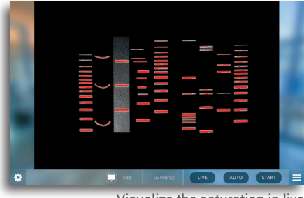
Visualize the saturation in live