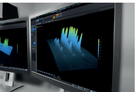
The FUSION FX delivers more significant quantitative data compared to other imagers.